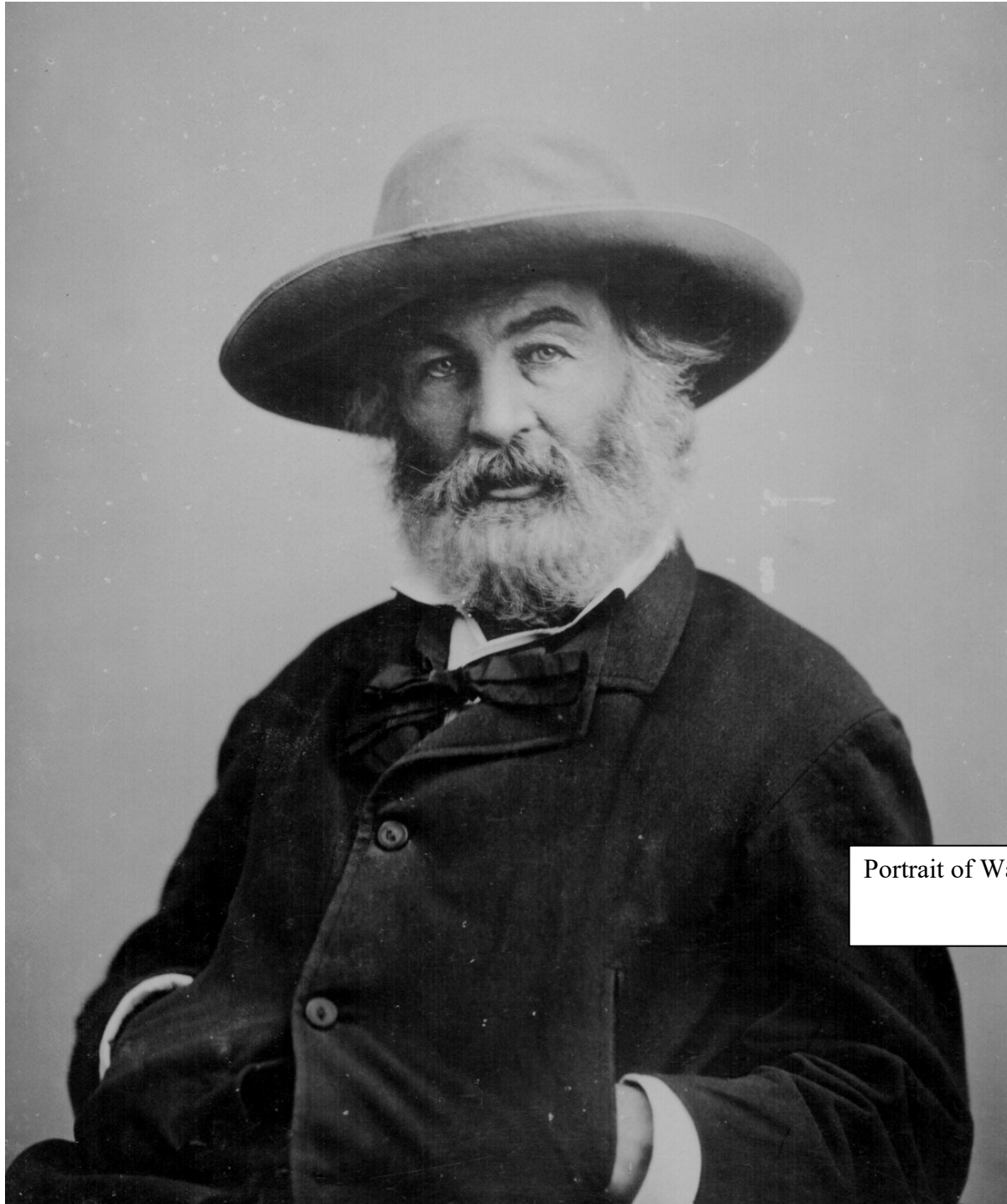
Portrait of Walt Whitman