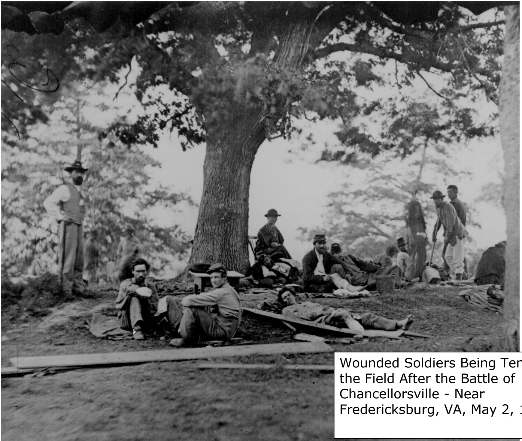
Wounded Soldiers Being Tended in the Field After the Battle of Chancellorsville - Near Fredericksburg, VA, May 2, 1863