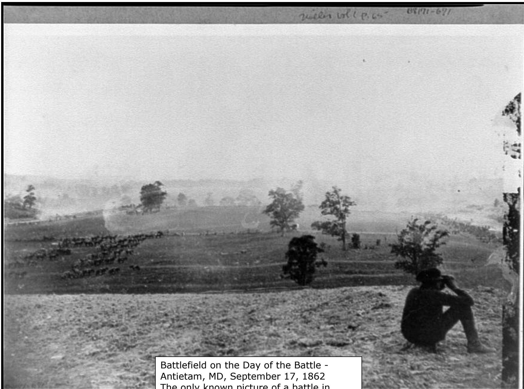
Battlefield on the Day of the Battle - Antietam, MD, September 17, 1862 The only known picture of a battle in progress during the Civil War.