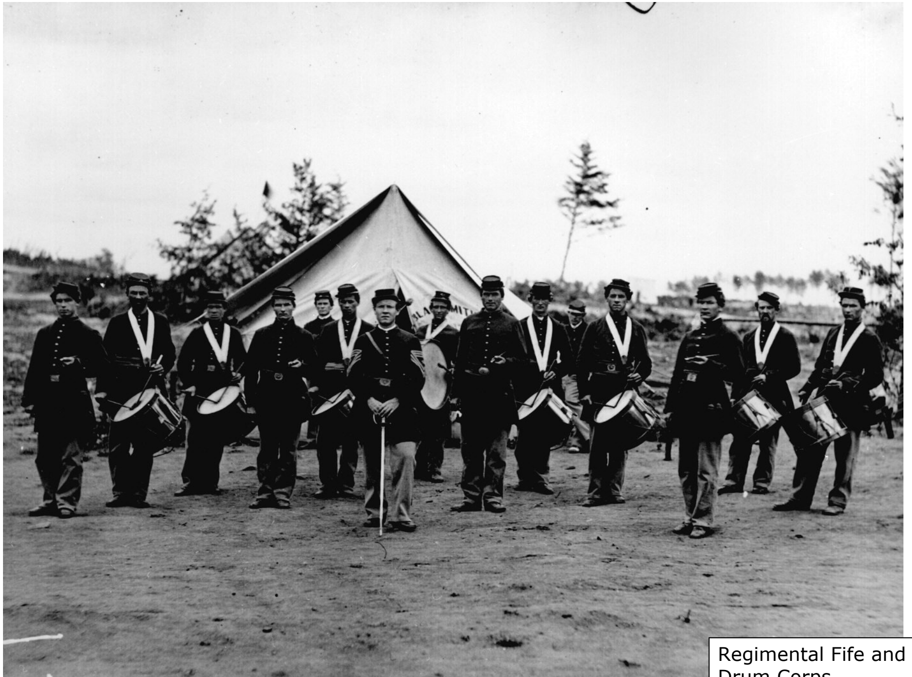
Regimental Fife and Drum Corps