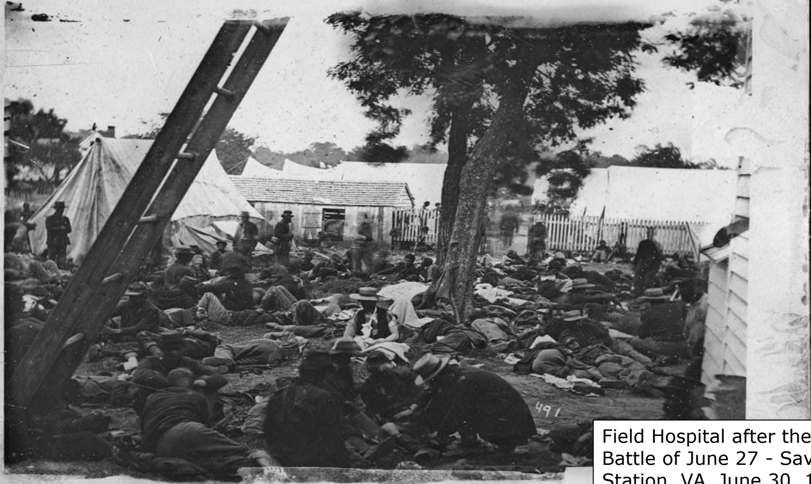
Field Hospital after the Battle of June 27 - Savage Station, VA, June 30, 1862