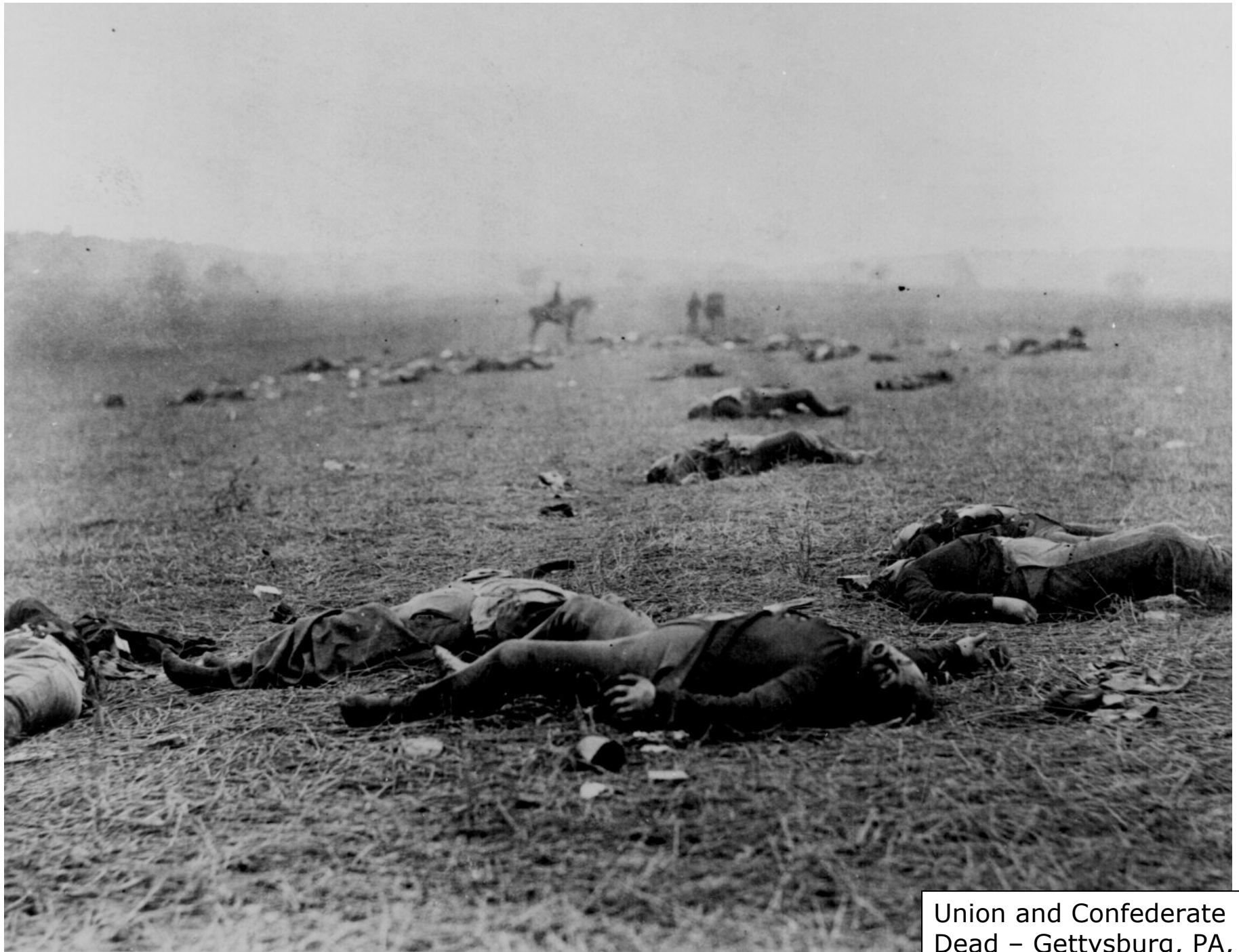
Union and Confederate Dead – Gettysburg, PA, July 1863