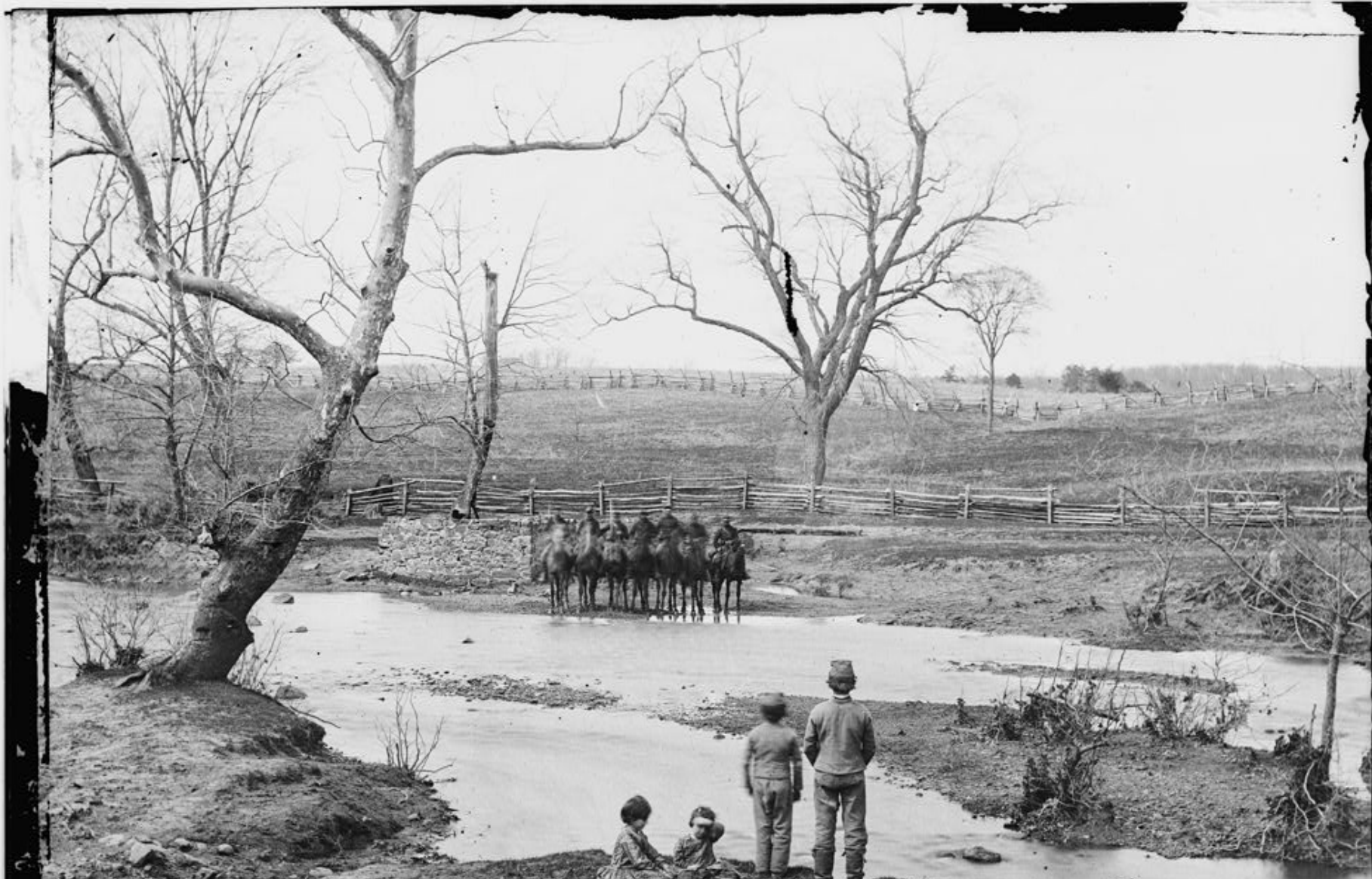
Federal Cavalry at Sudley Ford - Bull Run, VA, March 1862 Probably the crossing that Whitman described in "Calvary Crossing a Ford."